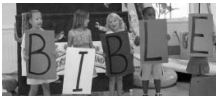
We thank God for the opportunity to reach out to children from our local Fulton community through Vacation Bible School. For more photos, visit our church website at www.goodhopepca.com/pictures/pictures.html .