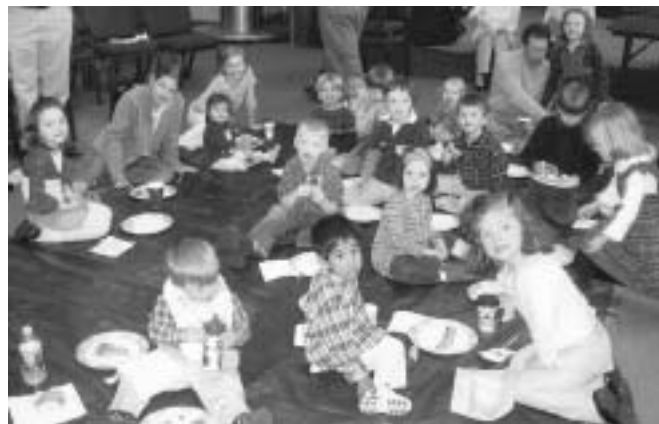
There's no shortage of little ones at Christ Our Redeemer in Cary!