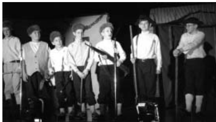
Some colonial men discuss their hunting plans in "In Search of Christmas."