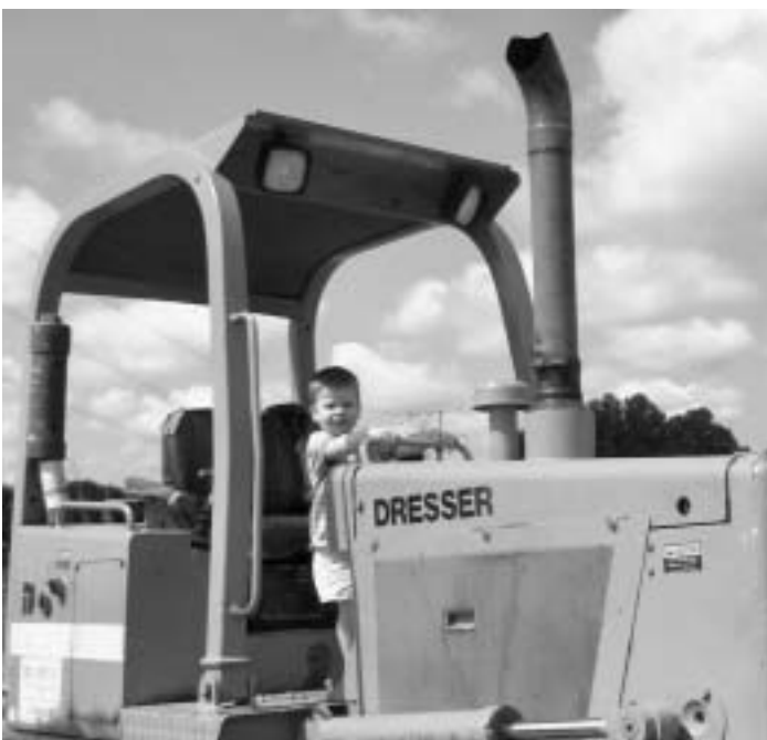
All volunteers are welcome to pitch in at the new church property!