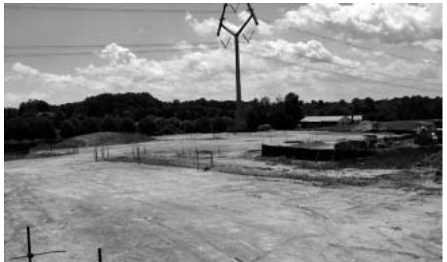
Making progress towards our future church parking lot on Route 216!

The most obvious recent sign of progress has been the grading and layout of the new parking lot. As soon as the rain clears for long enough, curbs will be added. Financial giving has continued to be more than anticipated but, unfortunately, so have expenses. Final arrangements with the bank have not yet been completed, but no problems are anticipated on that front. Our blessings continue. ❖