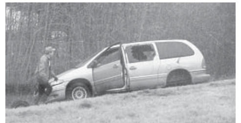
What really happened on this year's Ladies' Retreat...?