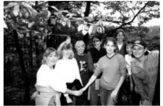
Hiking anyone? Camp Hemlock always provides a beautiful setting to "get away from it all" and enjoy a relaxing weekend together as a church.