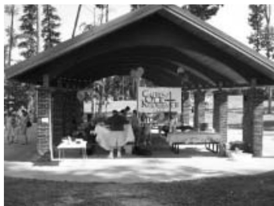
Christ Our Redeemer's first anniversary service in August!