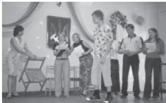
The advanced class sings "Billy Boy" at our talent show during this summer's English course.