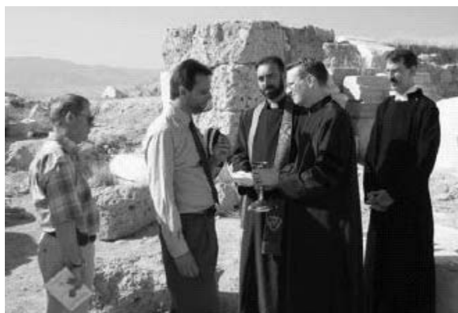
We were encouraged this summer by the 50 American visitors from our PCA partner church and the experience of one body of believers receiving the sacrament of communion together.